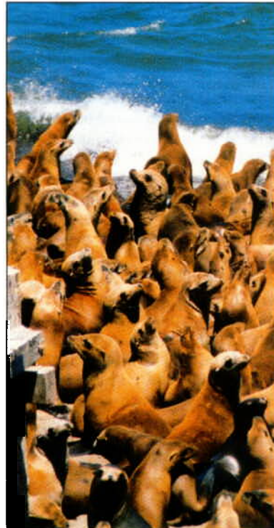
Hanging together. After the breeding season in the Channel Islands of California, male California sea lions ( Zalophus californianus ) of all ages aggregate in large numbers at Año Nuevo Island, 500 km to the north. Benefits of group living include thermoregulation, enhanced detection of predators, and improved foraging ability.

It is traditional for reviewers of encyclopedia to identify errors of omission, as the constraints on length inevitably produce gaps in coverage. The otherwise readable and original essay on pop culture emphasizes cetaceans but omits any significant references to pinnipeds, despite their overlapping presence with people in coastal areas around the world. For example, the ongoing invasion of California sea lions at San Francisco’s Pier 39 vastly affects local