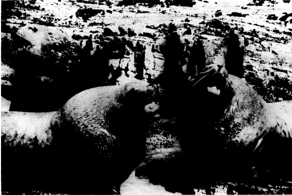
FIG. 2 Territorial display involving three males in the oblique stare posture. The displays occurred at the mutual boundary of all three territorial males. Note the forward position of the whiskers.

age from five to 19 years old was 286.8 \pm 34.7 cm and the mean length of 49 cows ranging in age from nine to 22 years old was 240.3 \pm 13.6 cm. Seventeen yearlings averaged 177.8 \pm 16.8 cm in length and 22 pups had a mean length of 100.6 \pm 7.3 cm. Thorsteinsen and Lensink (1962) presented data on the mean length of males ranging in age from nine to 17 years old. The corresponding mean lengths were 287.0 cm and 299.7 cm. They found no change in the mean length of males after the age of 13 years. Fiscus (1961) presented sex and age changes in body length. One male yearling was 178 cm while three male 10-year-olds had a length of 301 cm and two male 16-year-olds had a body length of 325 cm. A two-year-old female's body length was 180 cm and the lengths of three 12-year-old females were 243 cm. The kind of detailed information readily available on the body length of Eumetopias is not, to my knowledge, available on their weight. Generally speaking, fully grown males weigh about 1000 kg and fully grown females weigh about 273 kg. Scheffer (1945) found that the mean weight of three newborn males was 17 kg and that both male and female pups of 6-10 weeks old weighed approximately 40 kg.