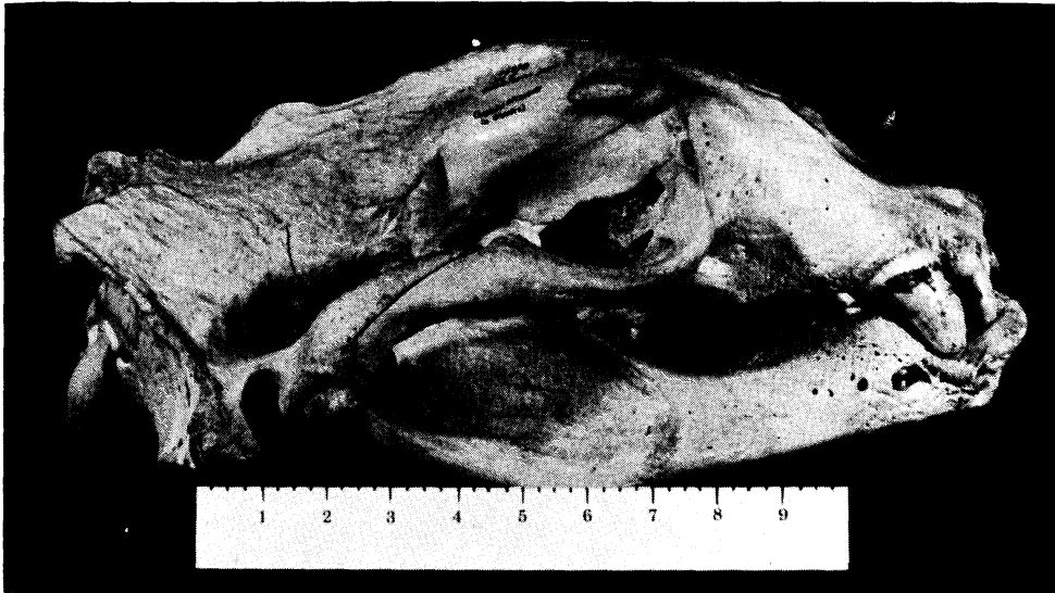
FIG. 4 Skull of fully grown adult male.

that a sagittal crest is strongly developed in males by seven years of age (see Figs 4 and 5). Sexual dimorphism is apparent in most skull characteristics. Most recently, Orr and Poulter (1967) have described several characteristics of the teeth of Eumetopias including: (a) the distinct generic trait of a marked space between the last two upper postcanines; (b) a decided sexual dimorphism in the permanent teeth; and (c) the distinctions between deciduous and permanent dentition (see also Spalding, 1966).