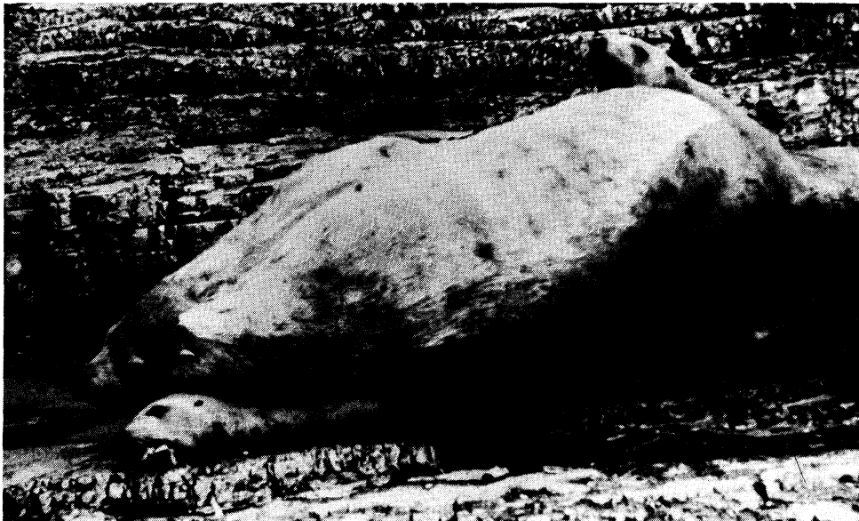
FIG. 1 Copulation in Steller sea lions. Note female lies passive with saliva running from her mouth while male lies with head and neck outstretched. An adult female vocalizes behind the mating pair.

As in all otariid forms Eumetopias shows a decided sexual dimorphism (Figs 1 and 2). Mathisen et al. (1962) presented data on the length of bulls, cows, yearlings and pups. The mean length of 46 bulls ranging in