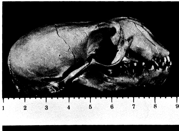
FIG. 5 Skull of five-month-old male.

that a sagittal crest is strongly developed in males by seven years of age (see Figs 4 and 5). Sexual dimorphism is apparent in most skull characteristics. Most recently, Orr and Poulter (1967) have described several characteristics of the teeth of Eumetopias including: (a) the distinct generic trait of a marked space between the last two upper postcanines; (b) a decided sexual dimorphism in the permanent teeth; and (c) the distinctions between deciduous and permanent dentition (see also Spalding, 1966).